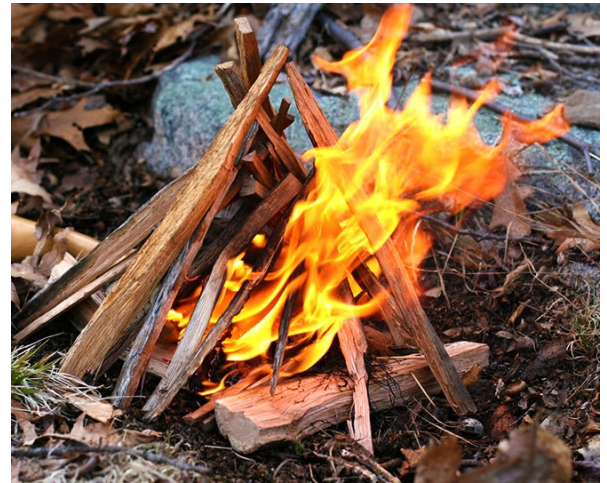
Love is a Bonfire!

When my parents were starting out in life, with five kids, and not a lot of money, they made a commitment to pay tuition to put us through parochial (religious) school. Somehow, they managed twelve years of this for us. For that investment, they probably could have had their house paid off, twice over! Besides the excellent training in radical forgiveness and unconditional love my parents gave us, in the home, modeled by the way they treated each other, I received some of my finest lessons in love from the committed religious and lay people who were my school teachers.