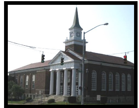
Fairview United Methodist Church, 828 West Fairview Ave., Dayton (corner of Catalpa Dr. and Fairview Ave.)

Due to the closing of Memorial Presbyterian Church, the September and October board meetings for our 2020-2021 program year will take place at Fairview United Methodist Church, 828 West Fairview Ave., (corner of Catalpa Dr. and Fairview Ave.). Come to the parking lot and enter the door under the green awning. (Please watch for news about the location of the 2021 board meetings.)